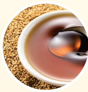
SESAME OIL زيت السمسم