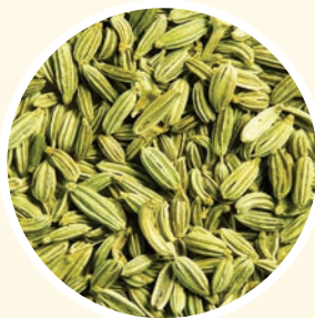
FENNEL SEEDS بذور الشمر