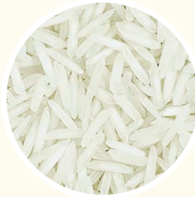
SHARBATI WHITE SELLA