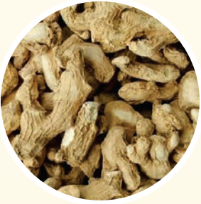
DRY GINGER الزنجبيل الجاف