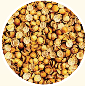
SPLIT CORIANDER SEEDS كزبرة مكسرة