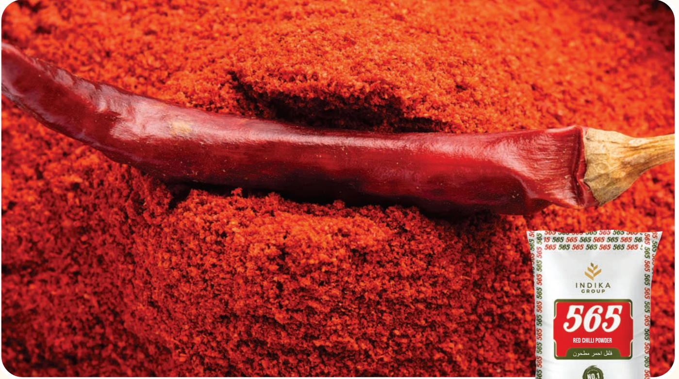
RED CHILLI POWDER فلفل احمر مطحون