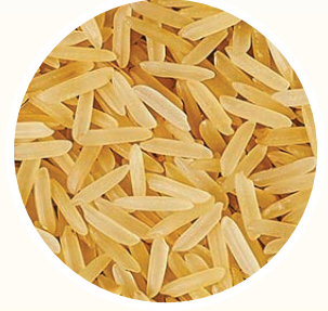
SUGANDHA GOLDEN SELLA