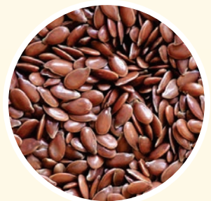
FLAX SEEDS بذور الكتان