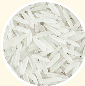
PUSA WHITE SELLA بوسا ابيض سيللا