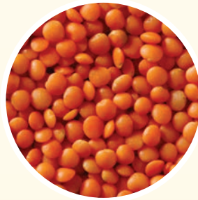
RED LENTILS FOOTBALL العدس الأحمر فوتبال