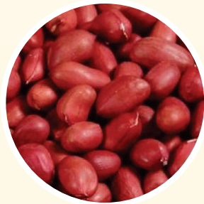
RAW PEANUT الفول السوداني الخام