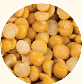
YELLOW SPLIT PEAS حمص مجروش أصفر