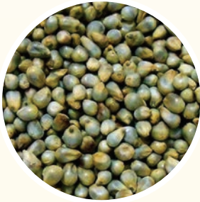
GREEN MILLET باجرا