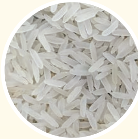
PR11 WHITE SELLA