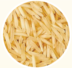
SHARBATI GOLDEN SELLA