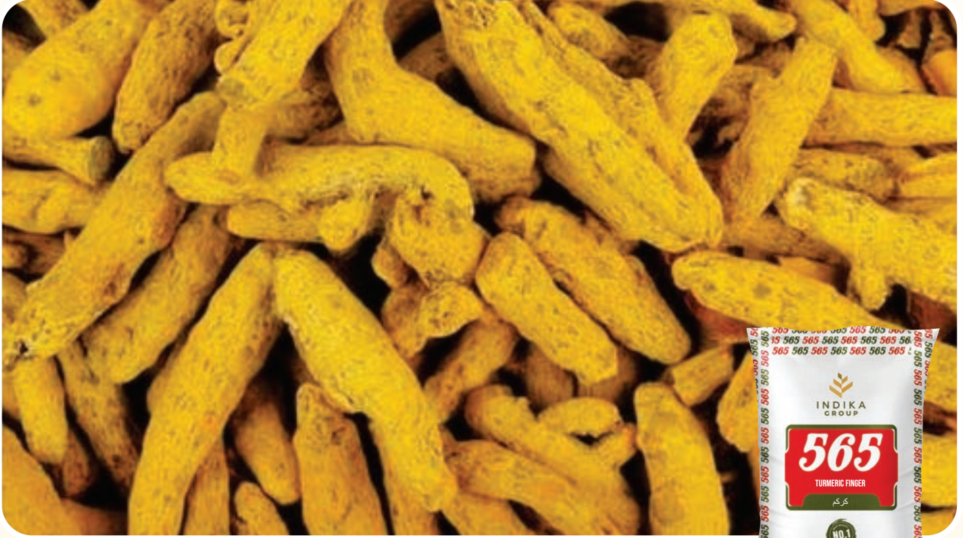
TURMERIC FINGER كركم