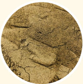
NUTMEG POWDER جوزة الطيب مطحونة