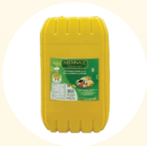
PALMOLEIN OIL زيت النخيل