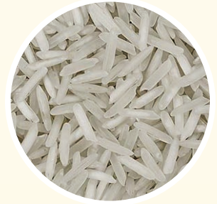
PUSA RAW بوسا خام