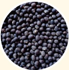
BLACK MATPE عدس أسود ماتب