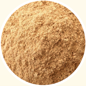
GINGER POWDER زنجبيل مطحون