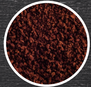
INSTANT COFFE AGGLOMERATE