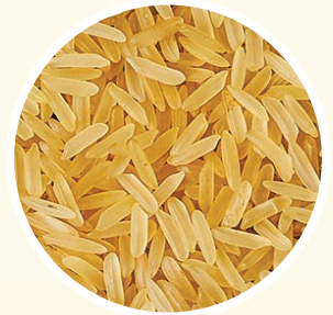
PR11 GOLDEN SELLA