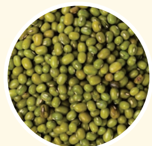
GREEN MOONG BEANS فاصوليا مونج خضراء