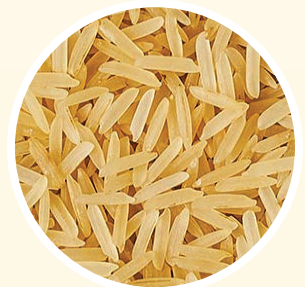
PUSA GOLDEN SELLA بوسا ذهبي سيللا