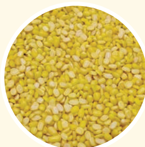
MOONG DAL عدس أصفر