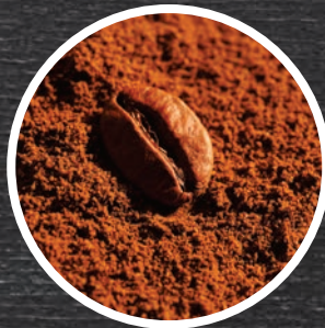
SPRAY DRIED INSTANT COFFE