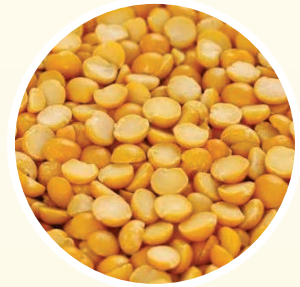
TOOR DAL عدس تور