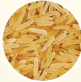
1509 GOLDEN SELLA 1509 ذهبي سيللا