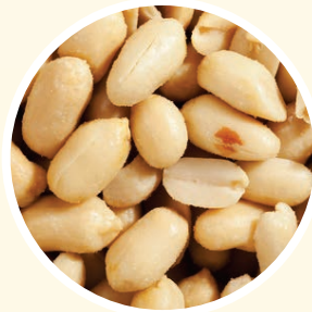
BLANCHED PEANUTS الفول السوداني المقشر