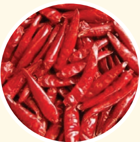
RED DRY CHILLI فلفل أحمر