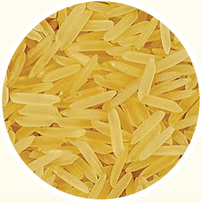
1121 GOLDEN SELLA 1121 ذهبي سيللا