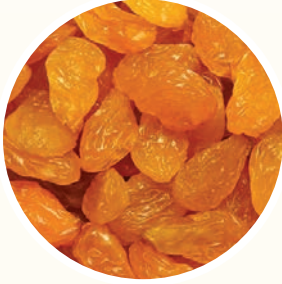
GOLDEN RAISIN زبيب ذهبي