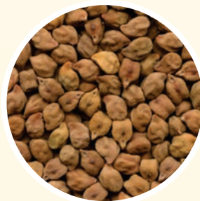
BLACK DESI CHICKPEAS حمص اسود