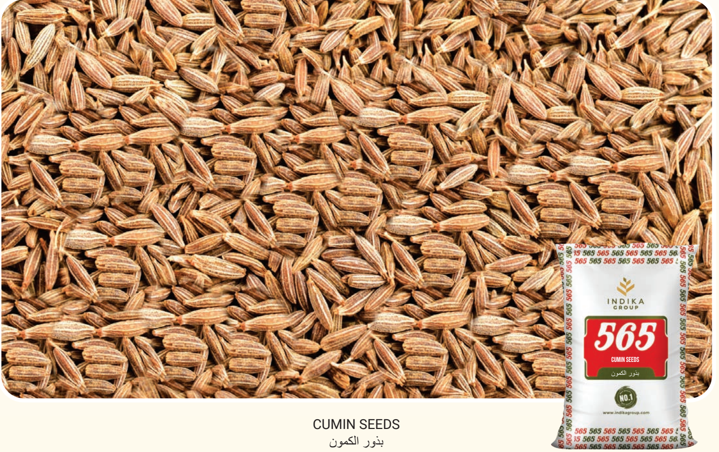
CUMIN SEEDS بذور الكمون