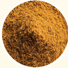
CUMIN POWDER كمون مطحون