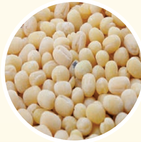
URAD DAL GOTA عدس أوراد أسود