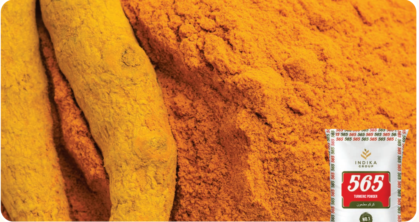
TURMERIC POWDER كركم مطحون