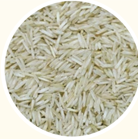
1509 RAW 1509 خام