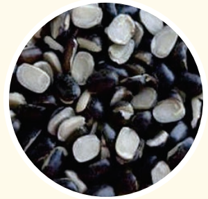
URAD DAL CHILKA عدس أوراد أسود