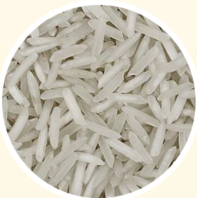
PUSA STEAM بوسا استيم