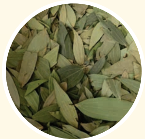
BAY LEAF ورق الغار