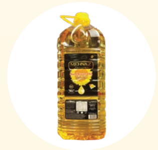
SUNFLOWER OIL زيت عباد الشمس