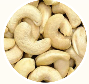
CASHEW NUTS كاجو