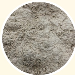
GARLIC POWDER ثوم مطحون