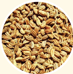
AJWAIN بذور الاجوين