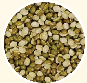
MOONG CHILKA عدس مونغ أخضر