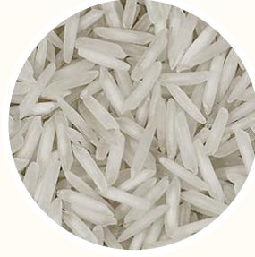
1121 STEAM 1121 استيم