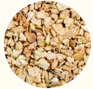
SOYA BEAN MEAL وجبة فول الصويا