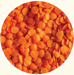
RED SPLIT LENTILS عدس مجروش أحمر