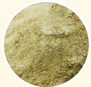
FENUGREEK POWDER حلبة مطحونة