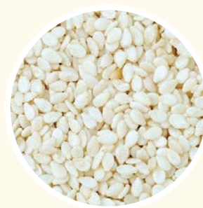
HULLED SESAME SEEDS بنور السمسم المقشر