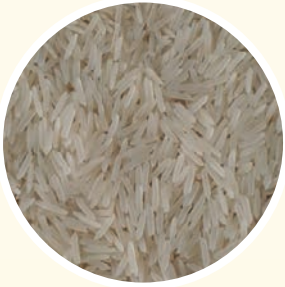
1509 WHITE SELLA 1509 ابيض سيللا