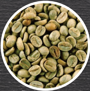
GREEN COFFE BEANS