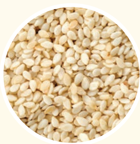
WHITE NATURAL SESAME SEEDS بنور السمسم الأبيض الطبيعي