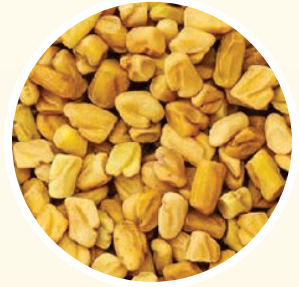
FENUGREEK SEEDS بذور الحلبة