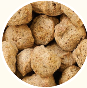
SOYA BADI فول الصويا