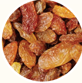
MALAYAR RAISIN زبيب مالايار