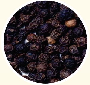
BLACK PEPPER فلفل أسود