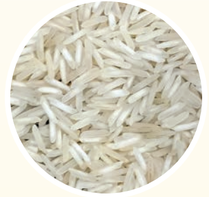
1509 STEAM 1509 استيم