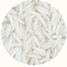
1121 RAW 1121 خام