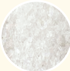
WHITE CRYSTAL SUGAR (ICUMSA 150/ICUMSA100) سكر أبيض كريستال