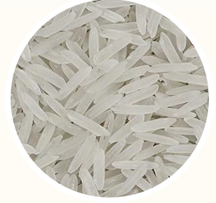
1121 WHITE SELLA 1121 ابيض سيللا