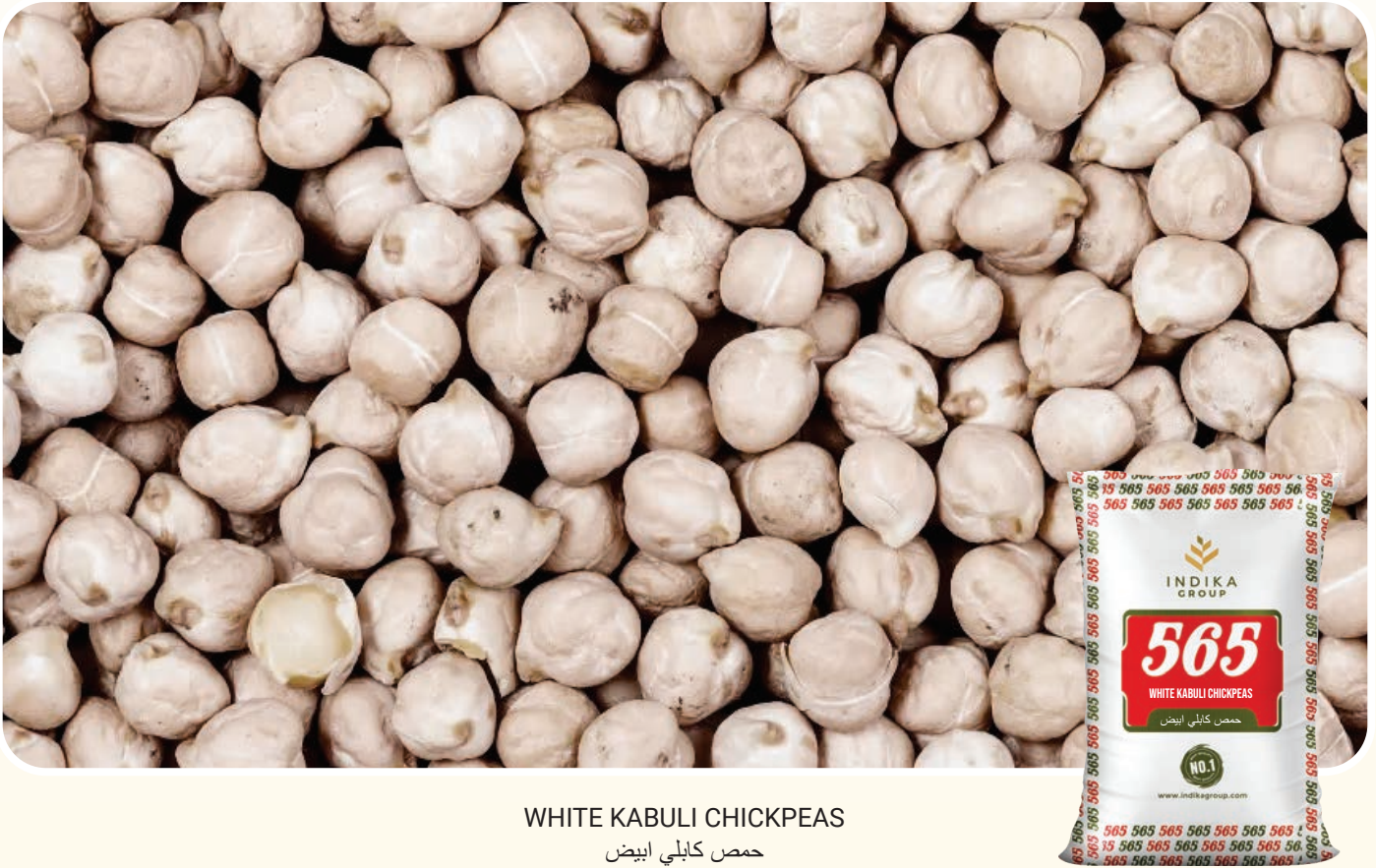
WHITE KABULI CHICKPEAS حمص كابلبي ابيض