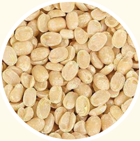
URAD DAL عدس أوراد