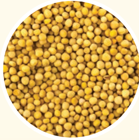
MUSTARD SEEDS بذور الخردل