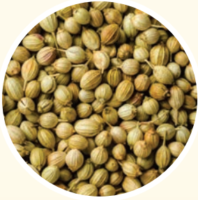
WHOLE CORIANDER SEEDS بذور الكزبرة