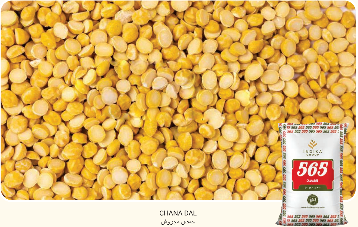
CHANA DAL حمص مجروش