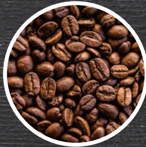
ROASTED COFFE BEANS