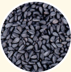
BLACK CUMIN SEEDS بذور الكمون السوداء